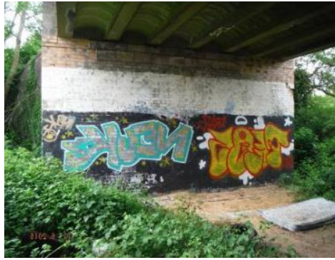
Images from 2016 showing evidence of fly-tipping and graffiti,